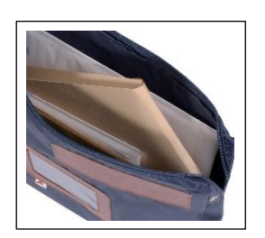
Ideal for mailings shipments

The biggest model waterproof mailing bag!