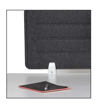
Easy to fix thanks to its wing screw system (supplied)