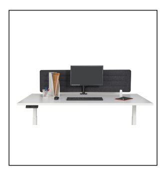
Contemporary style for a warm and welcoming work space