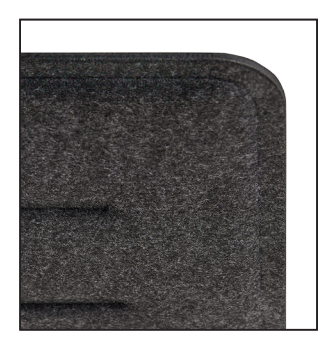
Relief structure and material quality for a high-performance acoustic panel