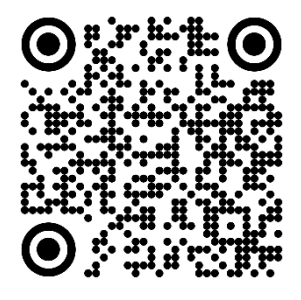
Scan to see our brochure