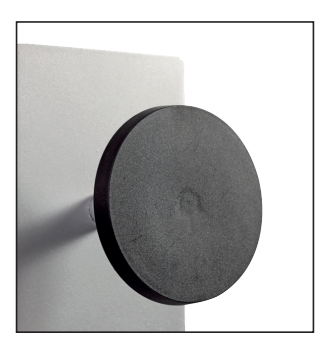
Large round coat hook for for perfect respect of the clothes