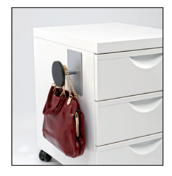
Easy to attach to any metal any metal surface