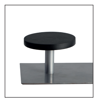
Sturdy steel frame and strong magnet (Can support up to 5 kg)