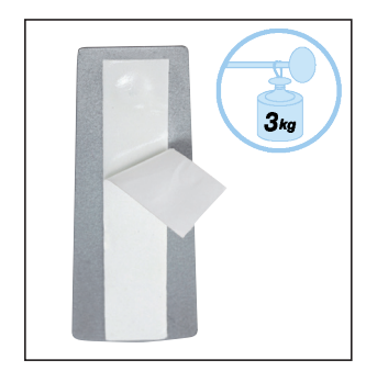
Sturdy aluminium structure and strong adhesive (Can support up to 3 kg)