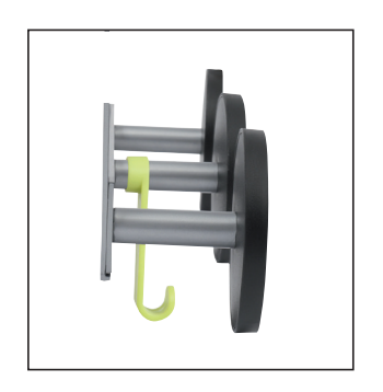
Robust structure and strong pegs (Can support up to 5 kg per peg)