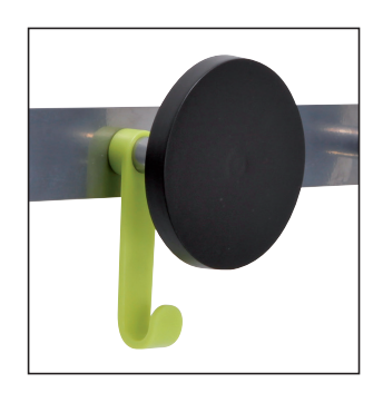
5 rounded pegs for a perfect respect of the clothes + 2 hooks for umbrellas and accessories.