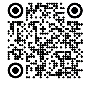
Scan to see our brochure